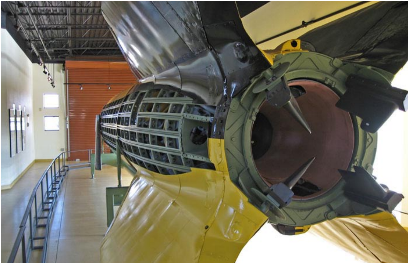
This view of the V-2 shows the cutaway side. Note the simulated carbon vanes that protrude into the exhaust area of the engine. By rotating the vanes and deflecting the exhaust one way or another, the V-2's control system kept the big rocket stable in early flight until it reached a high enough speed for the fins to work.

Interestingly, the architect of the V-2 rocket was Dr. Wernher von Braun who based much of his design on the pioneering work done by Dr. Robert Goddard during the 1930s near Roswell, New Mexico.