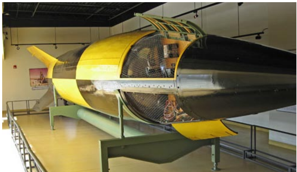
The V-2 as you enter the building. The control compartment is open so visitors can see the various components.