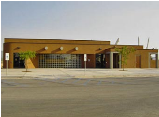
The V-2 exhibit building - just north of the Museum.

The V-2 rocket, painted with a white and black pattern was displayed across Headquarters Avenue in front of the headquarters building for about 50 years. The sun, rain, sand storms, etc. over those years caused significant deterioration.