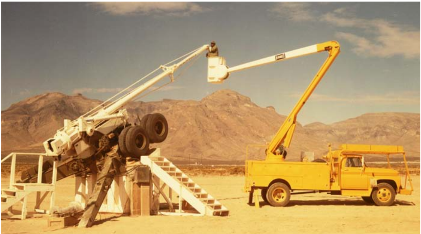
The Gun Probe cannon being placed in an unorthodox position at the Small Missile Range.