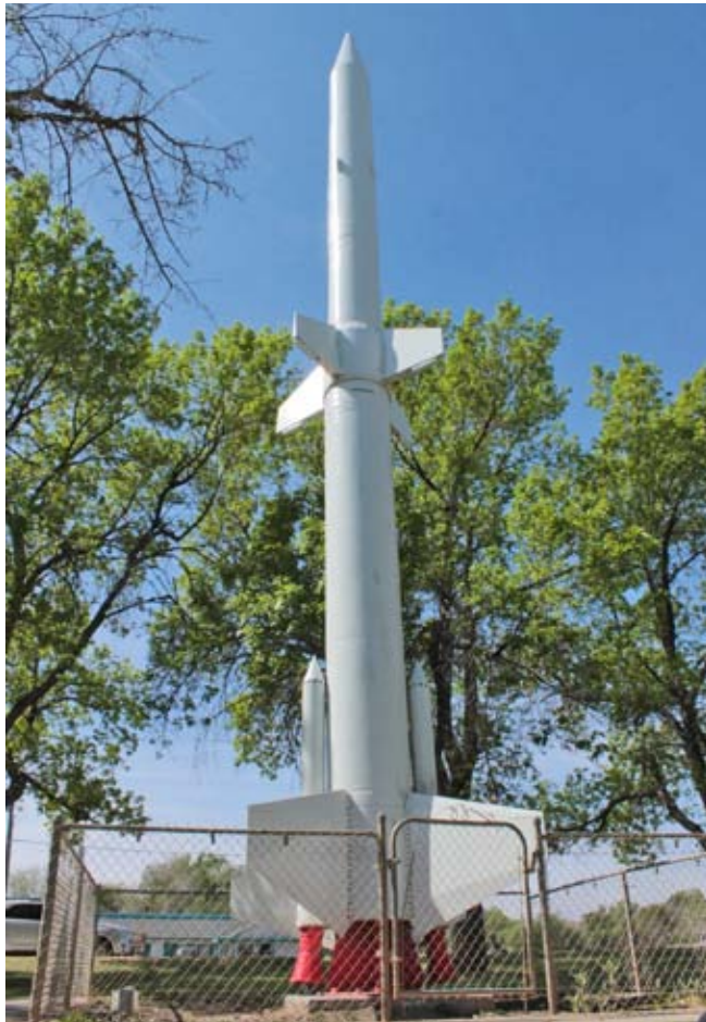
The Athena in Green River's park.