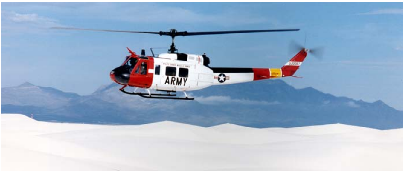
One of WSMR’s Huey helicopters being posed for a photo opportunity above some of the white gypsum dunes found on the missile range, north of the national monument.

Following the Huey’s final flight it was transferred through the Army’s Law Enforcement Support Office to the Louisiana State Police. Fittingly, the transfer to the LA State Police took place Dec. 22 and the aircraft departed Holloman Air Force Base for the last time 20 minutes before the last flight of its partner, the F-4, during the Vietnam War. Together, two iconic aircraft closed the book on that portion of aviation history.